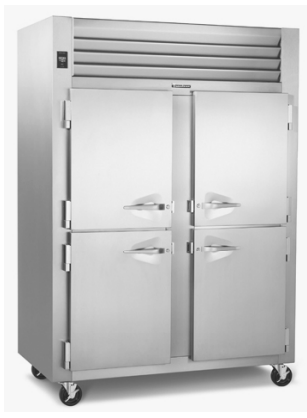
Model RLT232WUT-HHS (shown with optional casters)